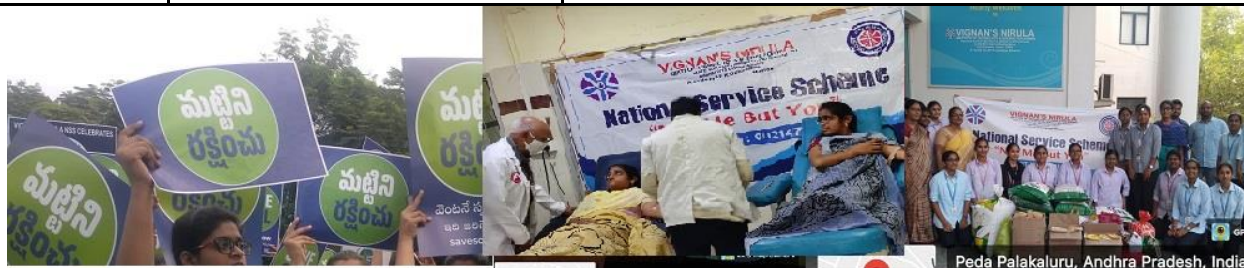
Save Soil campaign