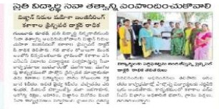
Special camp at China Palakaluru