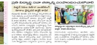
World water Day