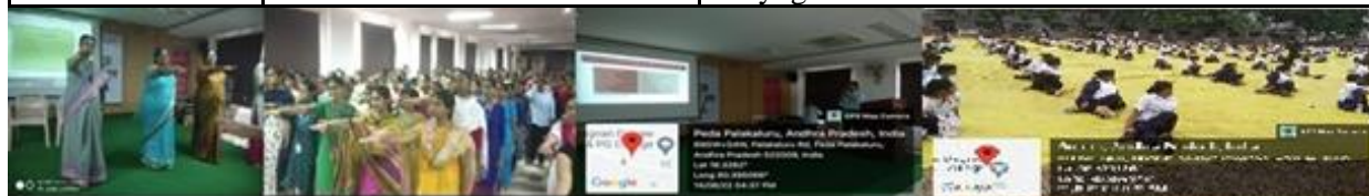
Oath on World Environment Day