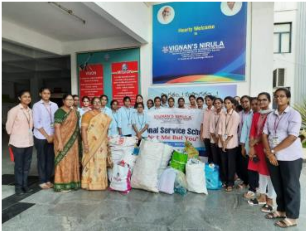
Collected the plastic waste