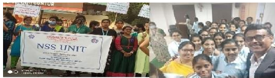
walk to support Gender Equality