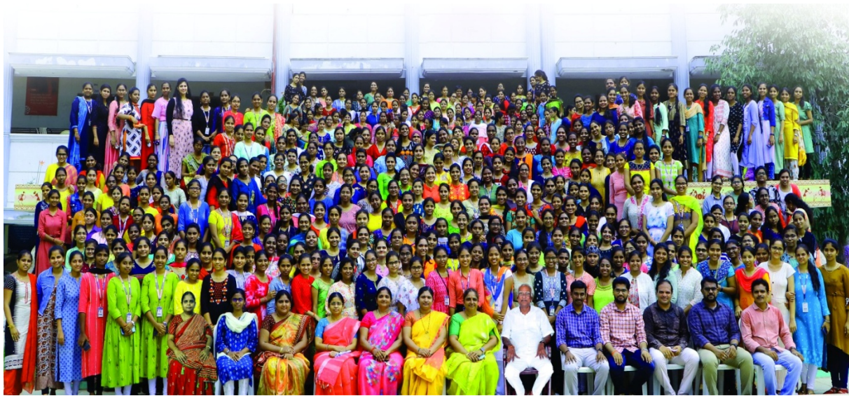
Cherishing Moments-Placement Success Meet-VNITSW